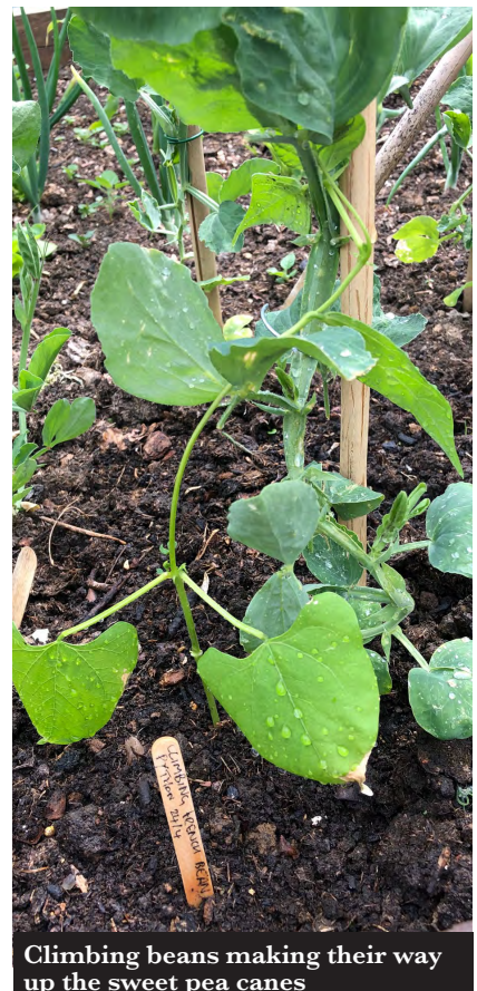
Climbing beans making their way up the sweet pea canes