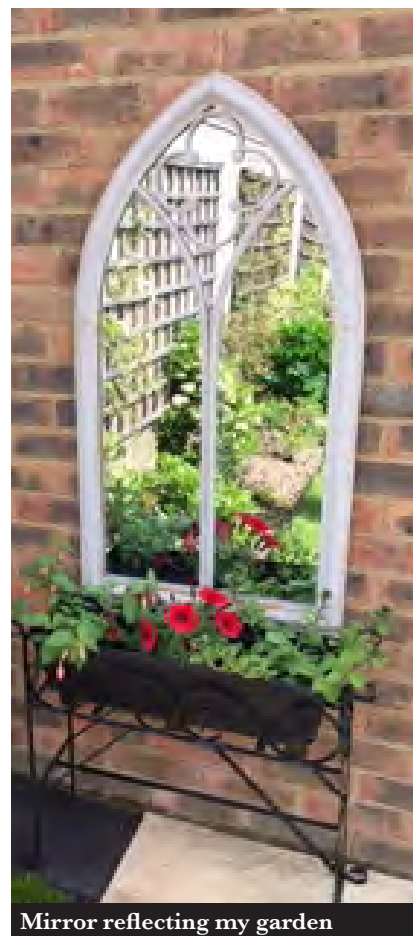
Mirror reflecting my garden