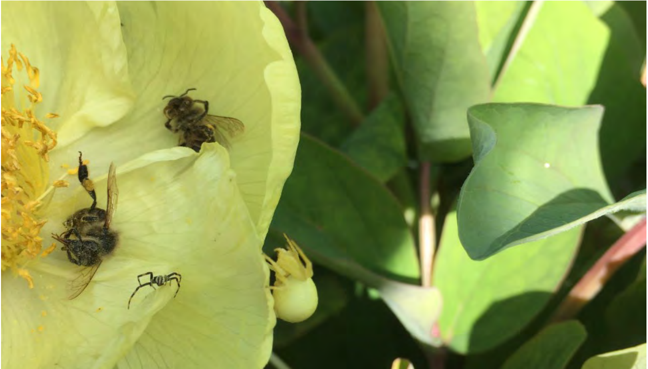
The Peony and the spider

I thought I would have a look at our yellow peony the other day, it has three days of glory every year and the rest of the time it doesn't do a thing. I was surprised to see a dead honey bee lying inside one of the flowers, closer inspection showed something sinister going on, as I touched the flower an amazing spider appeared in exactly the same livery as the flower, it matched exactly the somewhat citrus yellow of the flower. I watched fascinated as it hid beneath a petal and another bee appeared, in a flash the spider appeared and attacked the bee, obviously biting it with venom and in no time the bee was paralysed, whereupon the spider spent a happy 10 minutes sucking it's juices.