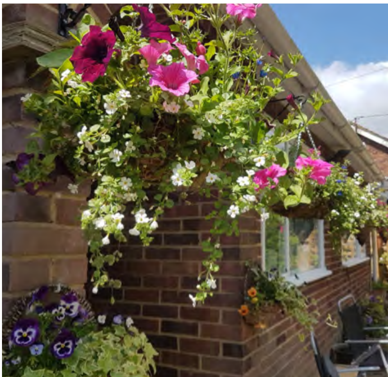
Hanging baskets finally planted