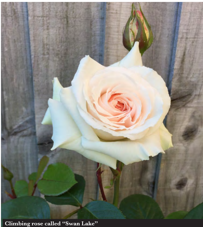
Climbing rose called "Swan Lake"