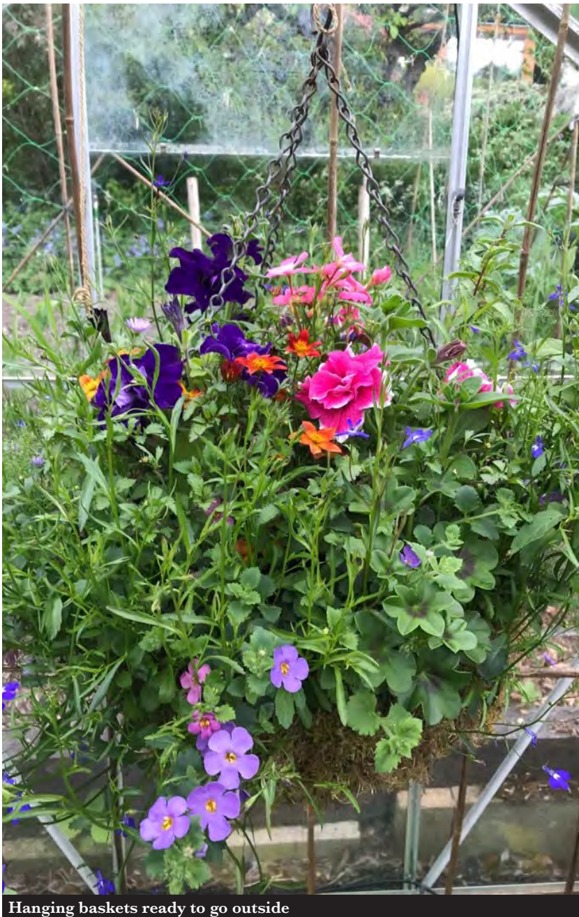
Hanging baskets ready to go outside