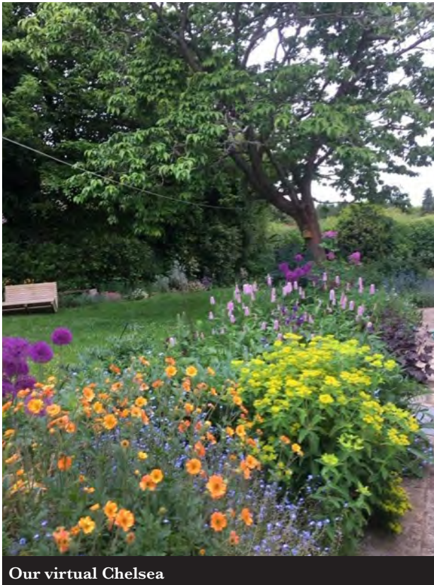
Our virtual Chelsea