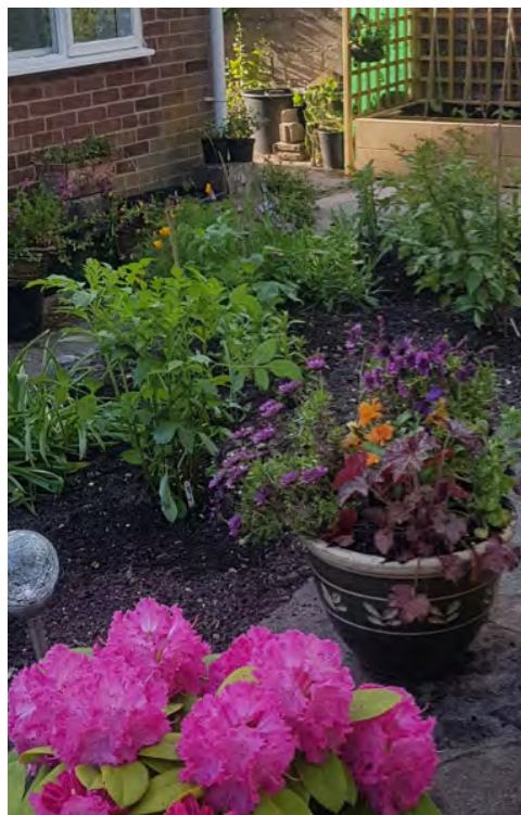
Dahlias planted beans in