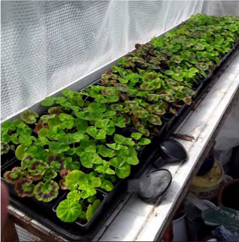
Geraniums in the greenhouse doing well